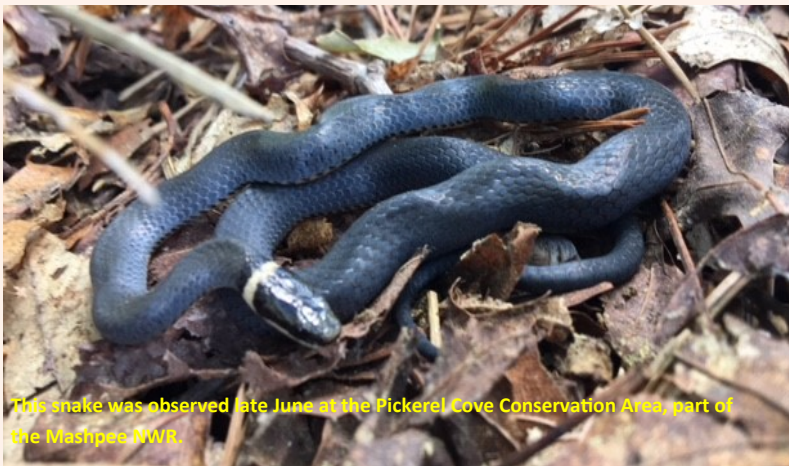
This snake was observed late June at the Pickerel Cove Conservation Area, part of the Mashpee NWR.

found in moist wetlands (abundant in Mashpee), where it eats red-backed salamanders (see upper right). This snake is slender and small, usually measuring from 10-15" long. It lays up 3-10, one-inch long eggs, in the spring or fall. It has smooth scales and a grey back. *Info from MassAudubon.org